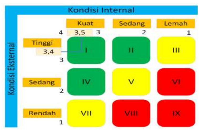
Figure 2 Mapping SWOT analysis results

Figure 2 shows that the internal conditions are in a strong position, while the external conditions are high, so that the ecotourism in Pinge Tourism Village is in a growth and built position.